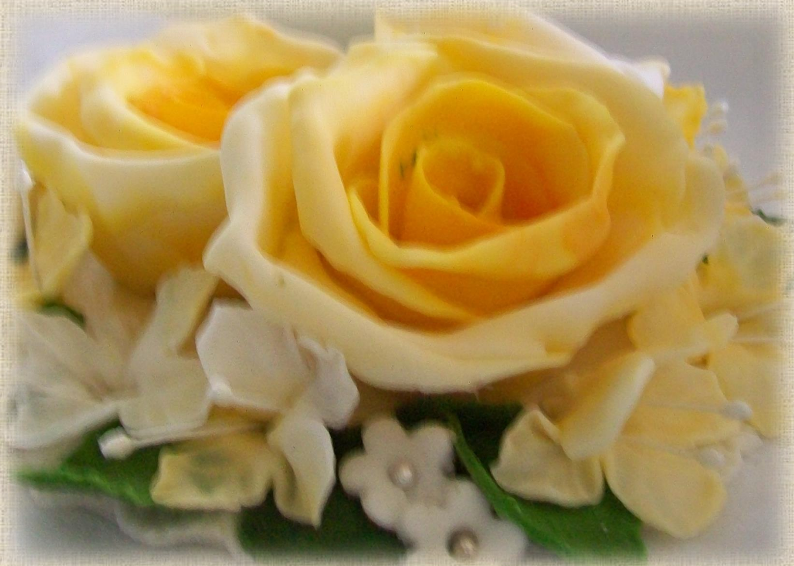
Lemon yellow roses with a mix of wild flowers- set on a vanilla cake.