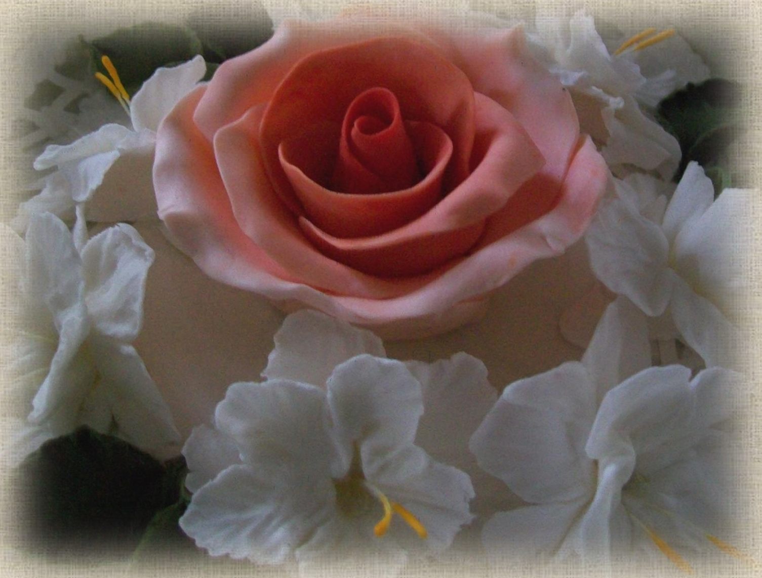
wild flowers sprinkled around a rose - cake topper. .