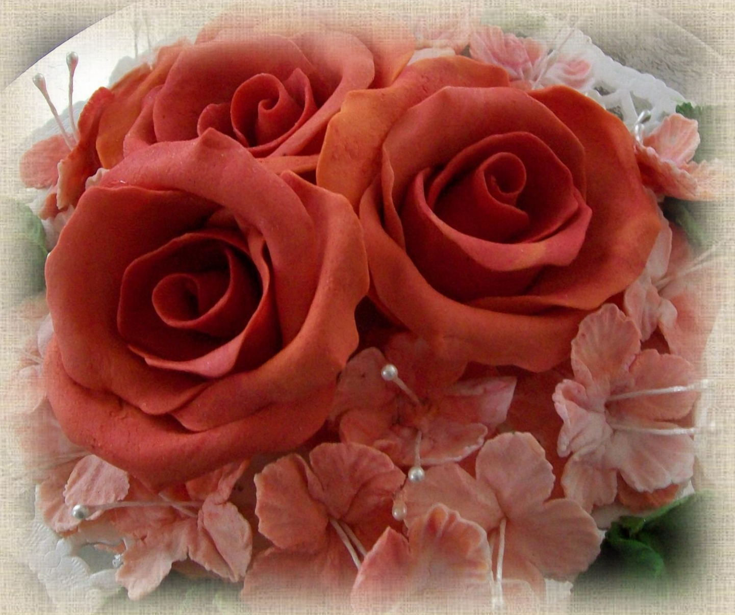
Tangerine roses with matching wild flowers- cake topper