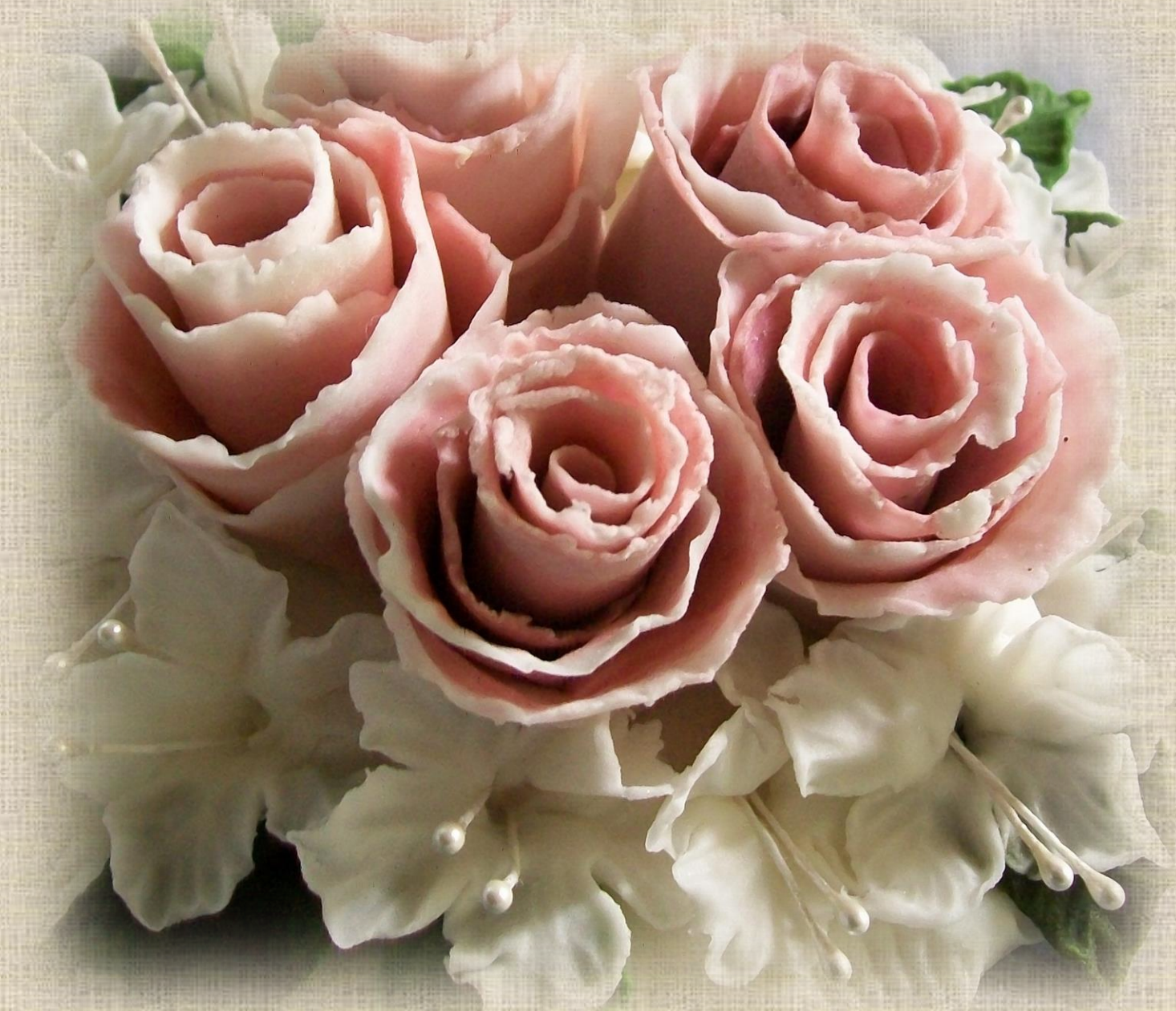
Pink Rose buds with wild flowers-cake topper.